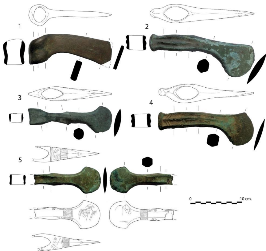
სურ. 2. ბრინჯაოს ცულები რიზეს მუზეუმიდან. 1. ყუამაილიანი ცული; 2-5. კოლხური ცულები.