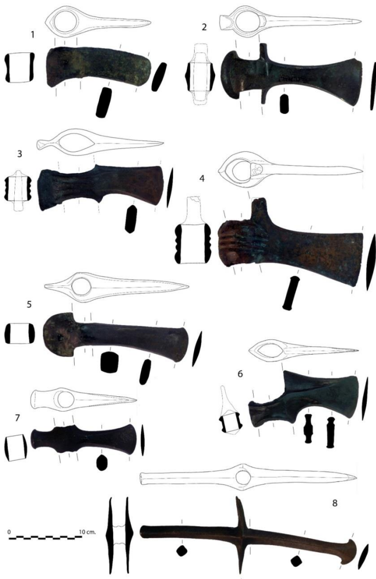
სურ. 3. ბრინჯაოს ცულები სამსუნის მუზეუმიდან.