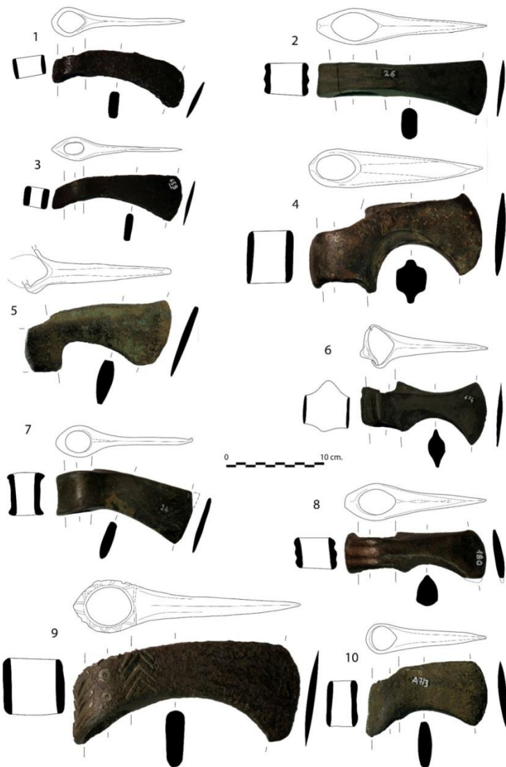
სურ. 4. ბრინჯაოს ცულები ტრაპიზონის მუზეუმიდან.